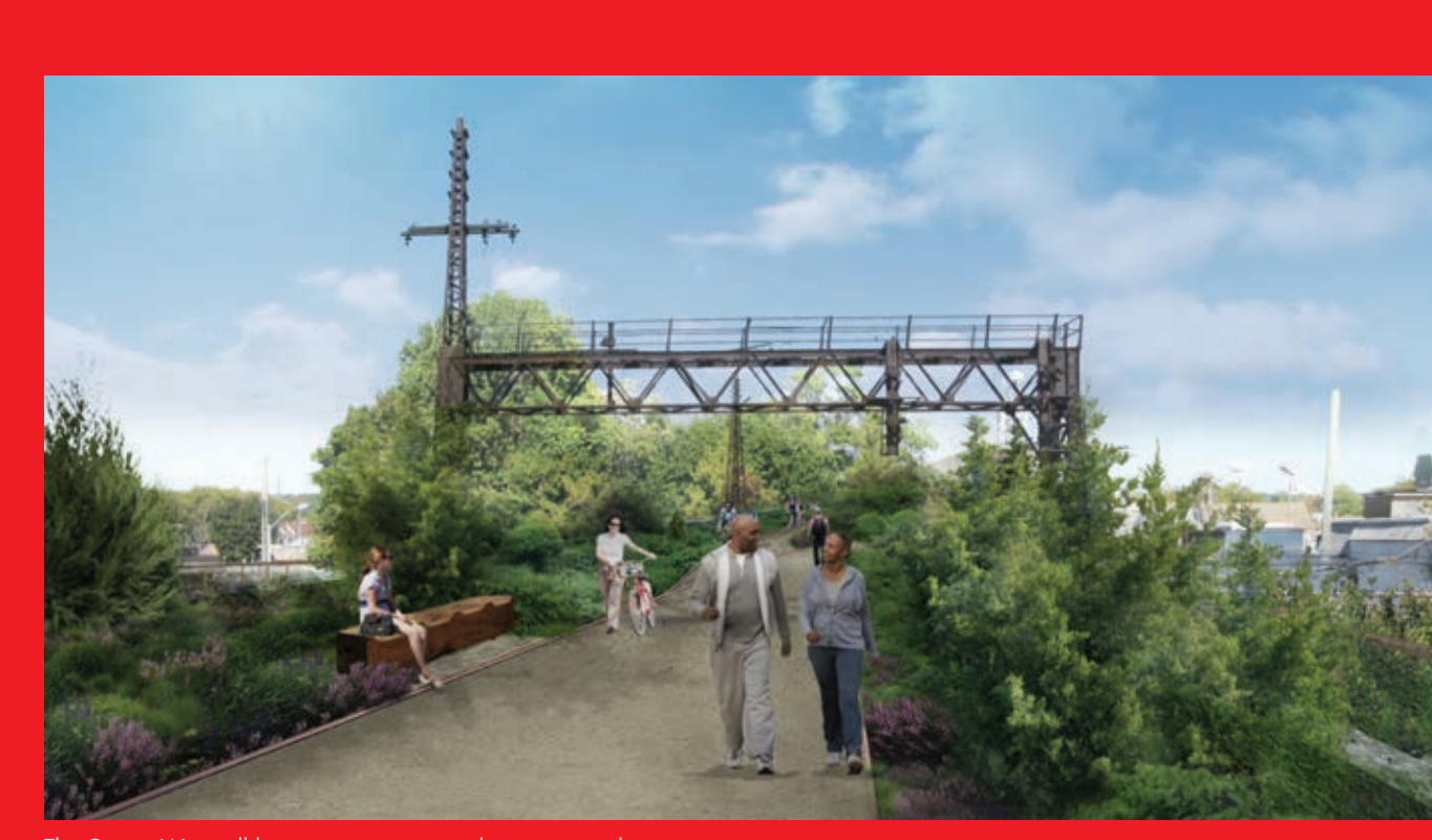
The QueensWay will have an organizational structure, such as a conservancy, to run programs and to help maintain the park

Lighting strategies will be developed to minimize light pollution for neighbors while focusing light along path-ways for the safety of park users. Lighting at activity spaces will be designed to ensure wide visibility across the park, and the viaduct section may employ additional lighting to allow for evening hours. The rail line trestles will be illuminated along the length of the park. In the areas without activities, lighting will be lower in height and more focused on pathways. Lighting at entrances park users, the QueensWay will have gates at all entrances. The park will close at dusk except during winter months, when it will remain open slightly later and more focused on pathways. Lighting at entrances will be positioned and designed to draw visitors to the QueensWay.